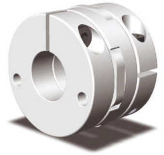
Hub version 1: clamp hub